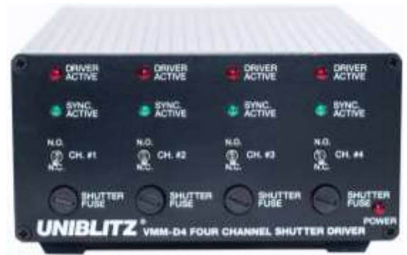
Fig. 1 VMM-D4 Four Channel Unistable Driver