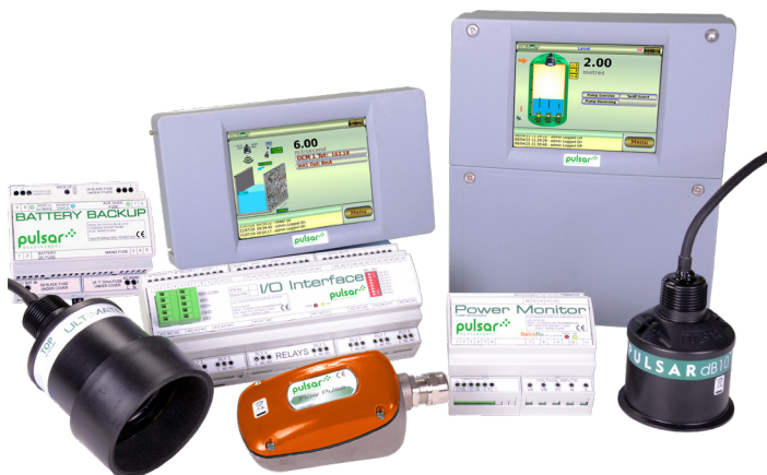
The Ultimate Controller Flow Group of Accessories

Data may also be downloaded locally via a removable SD card, while an internal SD card memory ensures that data is secure. Ultimate also offers optional Wi-Fi connectivity allowing you to access, program, and interrogate the system wirelessly.