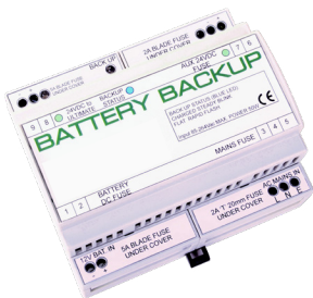
The Ultimate Controller Battery Backup Module

From Tariff Management to minimize your energy costs to Burst / Block alarms to Pump Prioritization based on efficiency. Pulsar Measurement's Ultimate Controller is packed with the advanced control features that bring effortless sophistication to pumping stations, meaning every installation can benefit from Pulsar Measurement's wealth of experience.