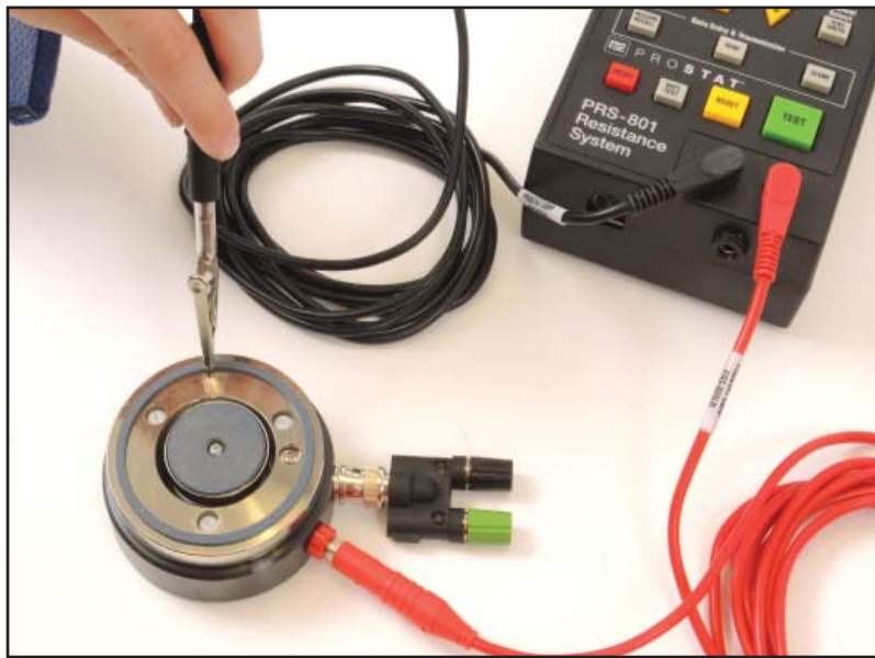
Figure 7: Confirming Outer Electrode