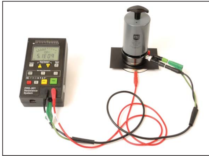
Figure 11: Fixture Preparation (Continued from Fig. 10)