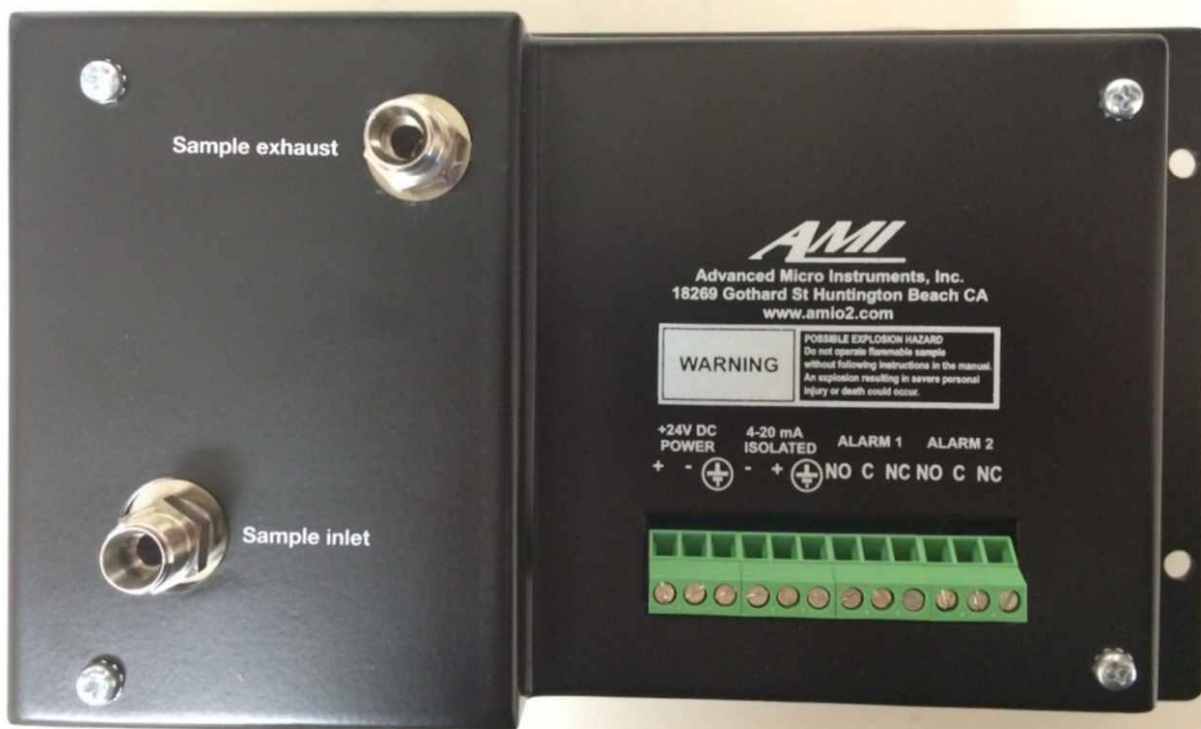
Figure 1. Back panel of 2001LC analyzer