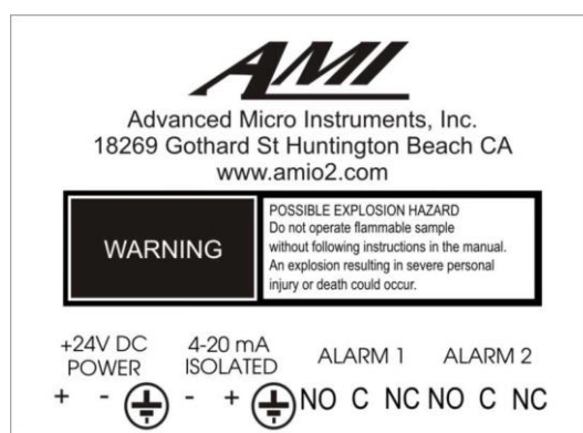
Figure 3. Back panel screen print of the 2001LCS.