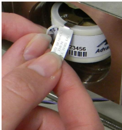
Figure 5. Inserting sensor in cell block

Dispose of leaking or used sensors in accordance with local regulations. Sensors usually contain lead which is toxic, and should generally not be thrown into ordinary trash. Refer to the MSDS to learn about potential hazards and corrective actions in case of any accident.