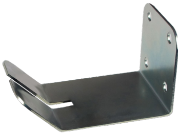
MicroFlow angled bracket

PC software is available to allow setup and run diagnostics using the MicroFlow PC via the RS485 connection. The PC software enables users to be able to set up, test, obtain and record readings from a sensor, giving users an idea of signal strength, stability, device parameters, and much more.