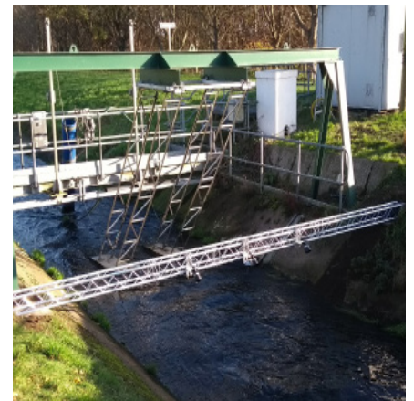
3 MicroFlow's on a wide channel