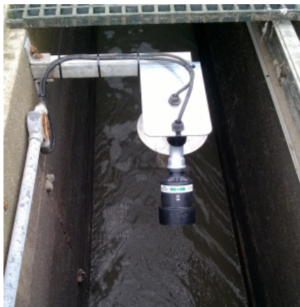
MicroFlow and dBMACH3