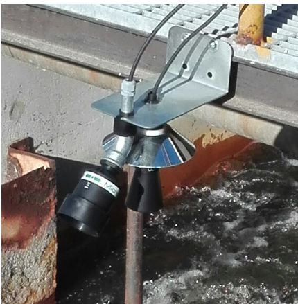
MicroFlow and dBMACH3 in a wastewater application

Thanks to Pulsar Measurement's award-winning and world-leading non-contacting technology, the MicroFlow sensor range does not include any serviceable parts and because it makes no contact with the application, there are no wear and tear issues.