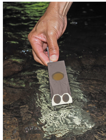
QZ02L Hyrdodynamic Sensor

MantaRay is easy to calibrate with its built-in keypad and simple menu system. Mount the sensor on the bottom of a pipe or open channel and hang the electronics enclosure above the high water level.