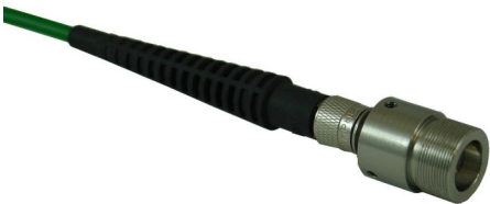
Fiber patch cord not included

The full field of view (FOV) or full divergence angle can be calculated as FOV = 2\arctan(D/2f) where D is the fiber core diameter and f is the focal length of the lens. Alternatively, the linear field of view on an object placed a distance L away from the collimator is D(L/f) .