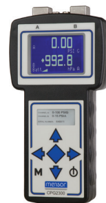
Portable digital pressure gauge, model CPG2300

The CPG2300 Portable Digital Pressure Gauge is used in diverse applications from rugged field calibration of pressure transmitters used in gas transmission, to testing and calibration of transducers in clean rooms and nuclear power plants. Wherever there is a need for a high level of accuracy in a handheld pressure calibration device.