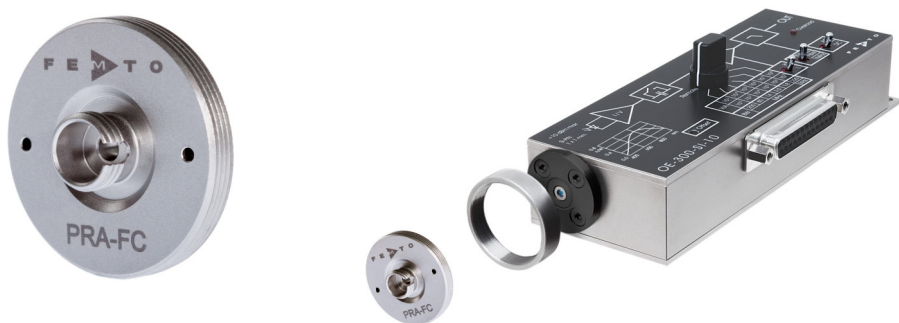
The picture shows fiber-adapter PRA-FC with photoreceiver OE-300-SI-10-FST.