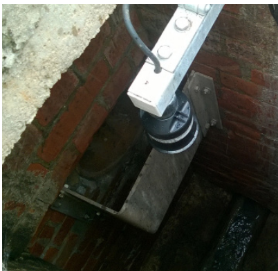
dBi HART on a CSO Application

The dBi HART Transducer series features Pulsar Measurement's world-leading echo processing software, Digital Adaptive Tracking of Echo Movement (DATEM). DATEM software allows the system to zero in on the echo from the true target and follow it as it moves up and down the vessel, ignoring the stationary echoes from other elements in the measurement path. Stanchions, chains, and ladders, which cause many ultrasonic systems to fail, are no barrier to Pulsar Measurement equipment. This allows the dBi HART transducers to give reliable and accurate measurement in applications where other manufacturer's equipment would not work.