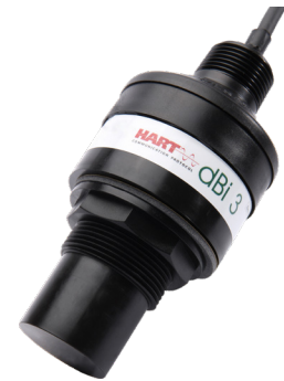
dBi3 HART Threaded Nose and PVDF Face

The first boot is approximately 8 seconds, if a typical 15-minute boot interval is used, this becomes approximately 3.5 seconds. The dBi transducers with HART will convert level to volume, and includes a library of typical tank shapes or a 16-point curve fit.