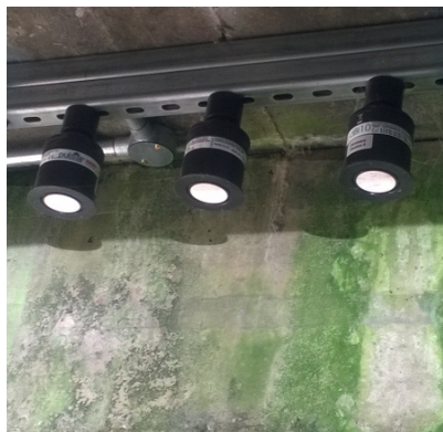
3 dBi HART transducers Monitoring Sludge Levels