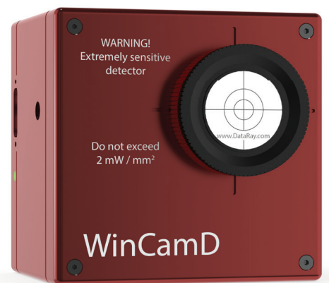
WinCamD-IR-BB 2.8 x 2.8 x 2.0 in 73 x 73 x 52 mm