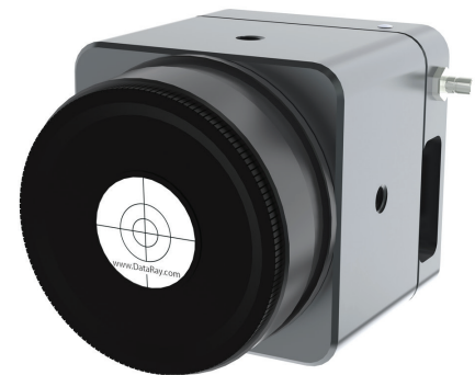
TaperCamD-LCM 2.25 x 2.25 x 2.13 in 57 x 57 x 54 mm

The TaperCamD-LCM is paired with DataRay's full-featured, highly customizable, user-centric software (which has no license fees, unlimited installations, and free software updates). It is perfect for applications including: CW and pulsed laser profiling; field servicing of laser systems; optical assembly; instrument alignment; beam wander and logging; R&D; OEM integration; and quality control.