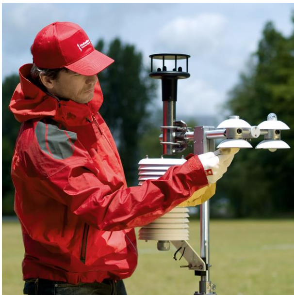
Figure 2 TP01 is typically used in high-accuracy surface flux measurement stations