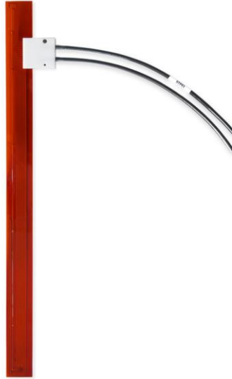
Figure 5 STP01 soil temperature profile sensor which is often combined with TP01 for soil energy budget calculation.

Hukseflux has equipped several testbeds in the electrical power industry, to monitor dryout, thermal runaway and thermal stability around mockup high-voltage power lines. Here the capability to perform a crude measurement of thermal diffusivity is an important feature, for modelling behavior under dynamic loads.