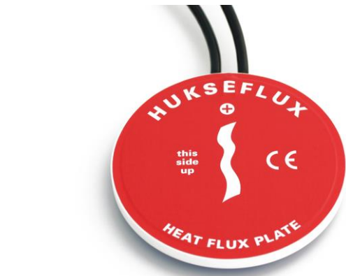
Figure 4 STP01 is often used in combination with HFP01SC self-calibrating heat flux sensor, shown in the picture