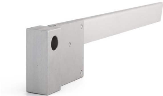
Figure 3 IT01 insertion tool is hammered down into the soil. After retracting it leaves a slit in which STP01 may be inserted

For ease of installation with a minimum of disturbance of the local soil, Hukseflux offers IT01 insertion tool.