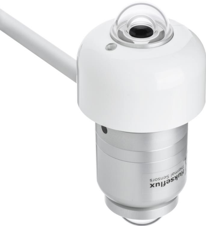
Figure 1 SRA30-M2-D1 albedometer

SRA30-D1 digital spectrally flat Class A albedometer is an instrument that measures global and reflected solar radiation and the solar albedo, or solar reflectance. SRA30-M2-D1 is the most accurate albedometer available, and heated for the best data availability. It is composed of one AMF03 albedometer mounting kit and two SR30-M2-D1 spectrally flat Class A (previously "secondary standard") pyranometers. This pyranometer is compliant in its standard configuration with the requirements for Class A PV monitoring systems of the IEC 61724-1:2017 standard. Each pyranometer has a thermopile sensor, the upfacing one measuring global solar radiation, the downfacing one measuring reflected solar radiation. AMF03 includes one glare screen, one mounting fixture with rod, mounting hardware and tools. SRA30 complies with the latest ISO and WMO standards. The modular design facilitates maintenance and calibration.