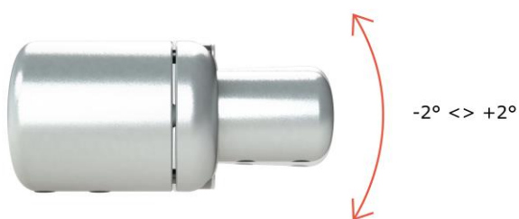
Figure 3 ALF01 albedometer levelling tool

ALF01 is a levelling tool that can be used with AMF03 to easily level the instrument. The ALF01 is mounted on a 1 inch outer diameter crossarm, and can be rotated around the tube axis for 360 ° as well as tilted over \pm 2^\circ .