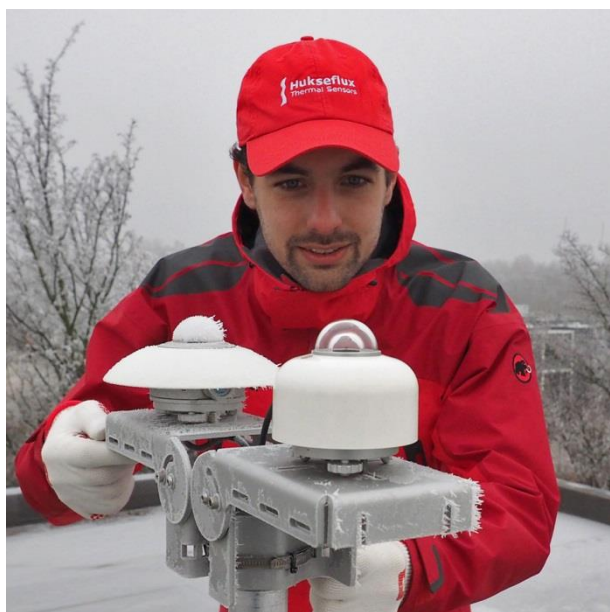
Figure 2 frost and dew deposition: clear difference between a non-heated pyranometer (back) and SR30 with RVH™ technology (front)