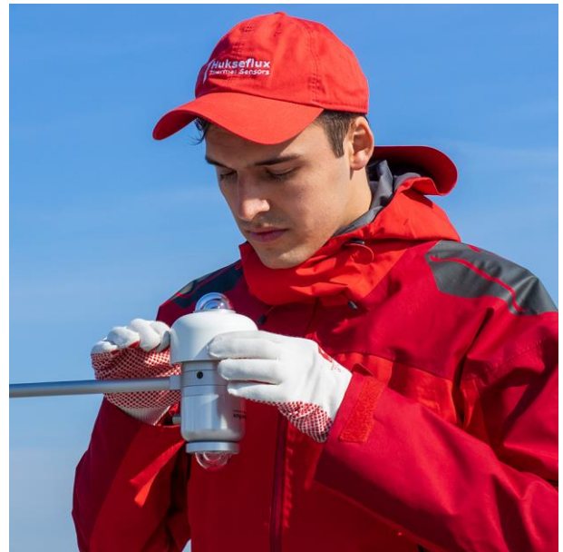
Figure 5 using SRA30 albedometer is easy; the instrument is composed of AMF03 and two SR30-M2-D1 pyranometers