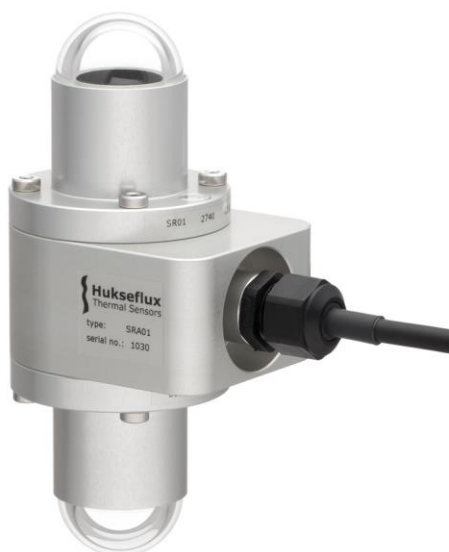
Figure 3 SRA01 second class albedometer, designed to fit a ¾ inch NPS mounting tube

SRA01 consists of two identical pyranometers model SR01, one facing up, one facing down. The albedometer body is designed to fit a ¾ inch NPS tube for mounting purposes. The cable can be led away through the tube (the tube's recommended outer diameter is < 28 \times 10^{-3} m, the inner diameter > 20 \times 10^{-3} m). Such a mounting tube is not part of the delivery. SRA01 can be ordered with longer cable and optional sun screens.