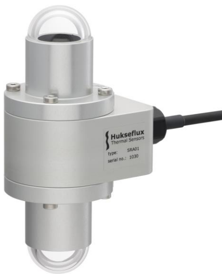
Figure 1 SRA01 second class albedometer

SRA01 albedometer is an instrument that measures global and reflected solar radiation and the solar albedo, or solar reflectance. It is composed of two identical second class pyranometers with thermopile sensors, the upfacing one measuring global solar radiation, the downfacing one measuring reflected solar radiation. SRA01 complies with the latest ISO and WMO standards.