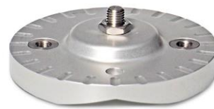
Figure 6 several mounting options are offered, such as this spring-loaded levelling mount for easy mounting, levelling and instrument exchanges on flat surfaces