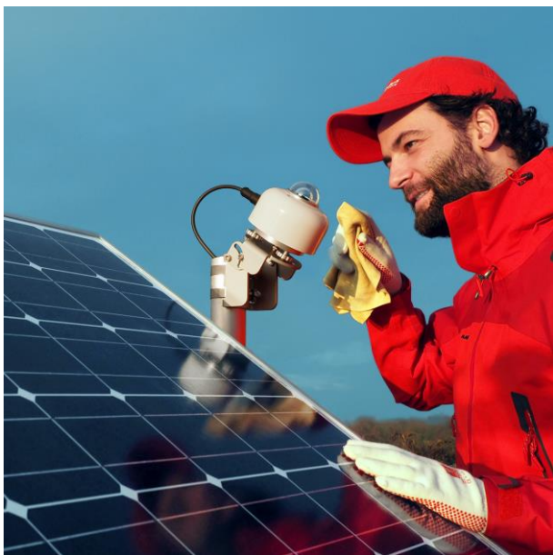
Figure 2 SR15 pyranometer mounted in PoA (Plane Of Array) on a mast for PV performance monitoring