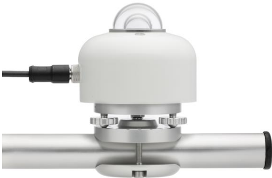
Figure 7 SR15 with optional tube levelling mount

About Hukseflux Hukseflux is the leading expert in measurement of energy transfer. We design and manufacture sensors and measuring systems that support the energy transition. Hukseflux products and services are offered worldwide via our office in Delft, the Netherlands and local distributors.