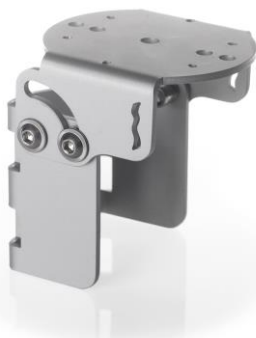
Figure 4 PMF01 mounting fixture accessory: practical, small footprint, and allowing horizontal and Plane of Array installations on various platforms

WMO, the World Meteorological Organization, recommends use of Class B (first class) pyranometers such as SR15 for network operation.