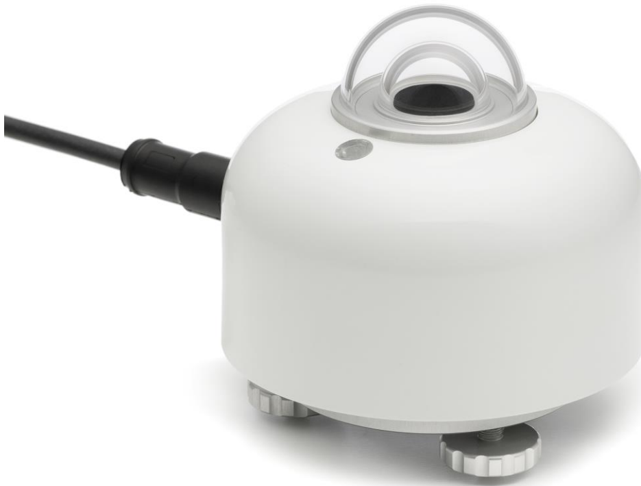
Figure 1 SR15 spectrally flat Class B pyranometer series

SR15 pyranometer series is a range of high-accuracy solar radiation sensors. It is "spectrally flat Class B", according to the ISO 9060:2018 standard and WMO guide. Various outputs are available, both digital and analogue. Versions SR15-D1 and SR15-A1 are equipped with an on-board heater, mitigating dew and frost.