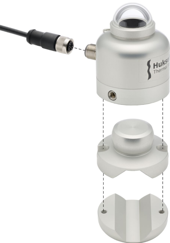
Figure 3 'Exploded view' of SR05-D1A3-PV. The optional ball levelling and tube mount allow for easy installations. The cable (standard 3 m) has an M12-A connector.

SR05 pyranometers employ a thermopile sensor with black coated surface, one dome and an anodised aluminium body with visible bubble level. Optionally the sensor can be delivered with a unique ball levelling mechanism and tube mount or dedicated mounting fixture, for easy installation. SR05-D1A3-PV has an industry standard digital output: Modbus RTU over half-duplex RS-485, that allows multiple sensors to be installed on a single network. In addition, SR05-D1A3-PV has analogue 0-1 V output.