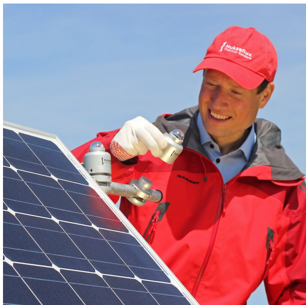
Figure 2 SR05's, one in PoA, replacing PV reference cells