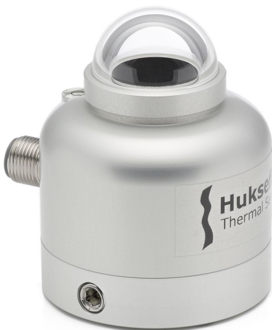
Figure 1 SR05-D1A3-PV pyranometer

SR05 series is the most affordable range of pyranometers meeting ISO 9060 requirements. These sensors are ideal for general solar radiation measurements and popular for monitoring PV systems. Model SR05-D1A3-PV is made as a perfect alternative to PV reference cells. It offers the same Modbus interface as the most common PV reference cell model for easy compatibility. Relative to PV reference cells, SR05-D1A3-PV has the advantage of higher stability, independence of the PV cell type or anti-reflection coating, and better availability and price of recalibration.