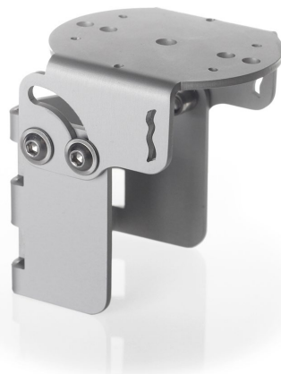
Figure 5 PMF01 mounting fixture accessory: practical, small footprint, and allowing horizontal and plane of array installations on various platforms