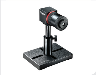
SP920s-1550 camera equipped with X4 Beam Expander to provide ISO beam profiling and good resolution for narrow and focused laser beams.

accuracy compared to Ophir InGaAs sensor cameras or Ophir NanoScan (scanning slit) beam analyzers. However, in case of smaller or focused beams, the SP920s-1550 can be used in combination with the X4 Beam Expander, thus reducing minimal size of analyzed beam to just 150µm.