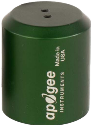
S2-112-SS & S2-412-SS