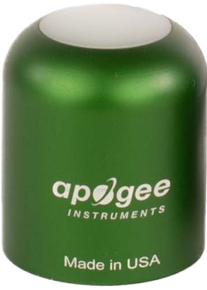
S2-111-SS & S2-411-SS