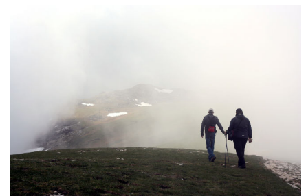
PWD50 reports meteorological visibility reliably from 10 meters to 50 kilometers (from 32 feet to 31 miles).

demonstrated very low failure rates. They have proved their robustness in the harshest climates and most demanding conditions, ranging from offshore to desert and from airport to roadside.