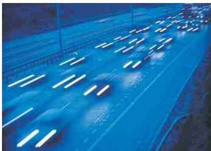
PWD12 is ideal for road weather applications.

The Vaisala Present Weather Detector PWD12 provides accurate visibility and present weather measurement in the road environment, where low visibility is a serious safety hazard and significantly reduces traffic flow rates. With a visibility measurement range of 10...2,000 meters, the Vaisala Present Weather Detector PWD12 is ideal for road weather applications. The PWD12 also indicates the cause of reduced visibility to give you a full picture of weather conditions. Its ability to detect precipitation and identify precipitation type gives the road authority valuable information for the short-range planning of road maintenance operations.