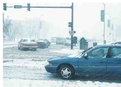
PWD-series sensors can be used in planning the road maintenance.

The PWD22 is equipped with two Vaisala RAINCAP® sensor elements to improve detection sensitivity during light precipitation events – even light drizzle is detected. The PWD22 also reports present weather in WMO METAR code format so it is easily integrated with AWOS systems.