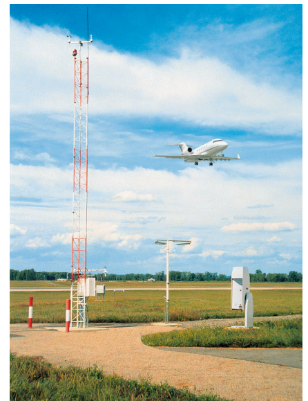
PWD22 is recommended for automatic weather observation systems (AWOS).

PWD22 is equipped with two Vaisala RAINCAP® sensor elements to improve detection sensitivity during light precipitation events – even light drizzle is detected. PWD22 also reports present weather in WMO METAR code format so it is easily integrated with AWOS systems.