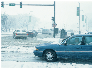
PWD sensors can be used in planning road maintenance.

With a measurement range of 10 ... 20 000 meters, PWD20 offers long-range visibility measurement for diverse applications covering harbors, coastal areas, heliports, windmill parks – indeed, any locations or areas where visibility measurement is necessary.