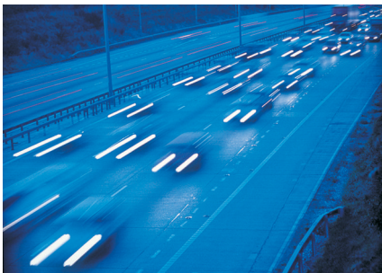
PWD12 is ideal for road weather applications.

With a measurement range of 10 ... 2000 meters, PWD10 offers economical and reliable visibility measurement for road weather applications. PWD10 is recommended for road weather systems that alert drivers to e.g. reduced visibility.