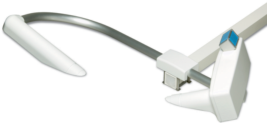
Vaisala Present Weather Detector PWD22