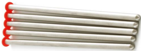
Figure 3 GT03 guiding tubes (not included)

Suitable for hard soils and concretes: use MTN02 in combination with GT03 Guiding tubes (ordered separately in sets of 5). Using these tubes it is possible to measure in hard materials such as cements and thermal backfill (heavy clay) and dried-out soil by casting them into specimens.