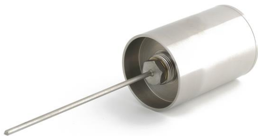
Figure 2 MTN02: Mounted on insertion tool IT03, the thermal needle TP07 is inserted into the soil.