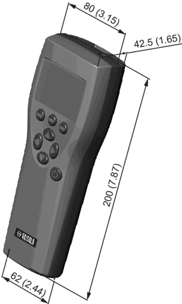
Indicator dimensions in mm (inches)