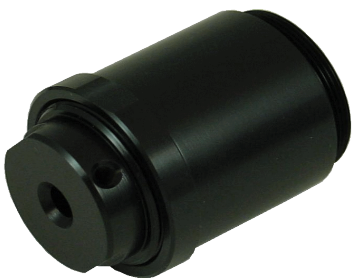
Light guide collimator

The full field of view (FOV) or full divergence angle can be calculated as FOV = 2\arctan(D/2f) , where D is the light guide core diameter and f is the focal length of the lens. Alternatively, the linear field of view on an object placed at a distance L away from the collimator is D(L/f) .