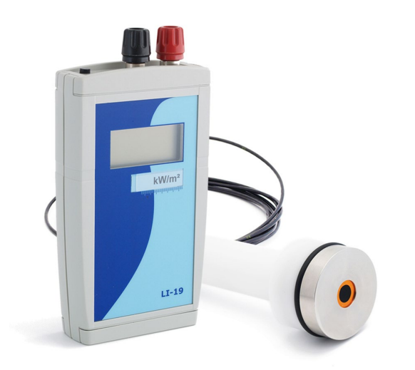
Figure 3 application example: with HF03 heat flux sensor

LI19 is built for easy use with a large size LCD, displaying quantities in W/m^2,\,\text{and}\,a\,\text{USB} connection.