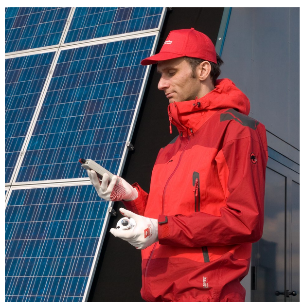
Figure 4 L119 with a pyranometer in a field measurement

Figure 3 application example: with HF03 heat flux sensor