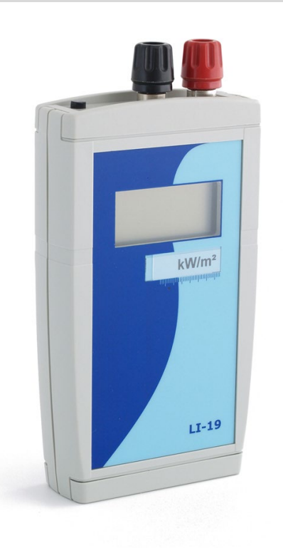
Figure 1 LI19 read-out unit / datalogger

LI19 is a high-accuracy handheld read-out unit / datalogger. It is used to make mobile measurements, for short term datalogging (as a static logger), and as an accurate millivolt amplifier directly connected to a PC. LI19 can be used with a variety of sensors. LI19's most common application is with heat flux- and solar radiation sensors. LI19 battery life and memory allow continuous measurement for up to 50 days.