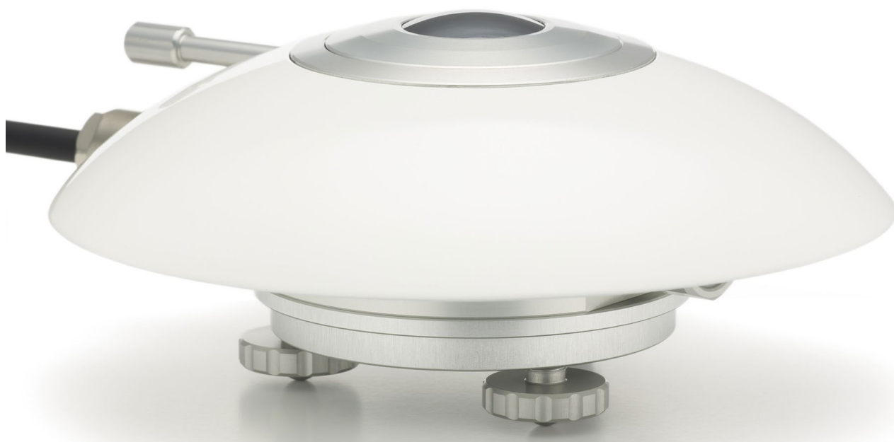
Figure 1 IR20 research grade pyrgeometer

IR20 is a research grade pyrgeometer suitable for high-accuracy longwave irradiance measurement in meteorological applications. Thanks to Hukseflux' technological innovation, IR20 is offered at a significantly lower price level than competing models of the same performance level. IR20 is capable of measuring during both day and night. In absence of solar radiation, model IR20WS offers even better accuracy because of its wider spectral range.