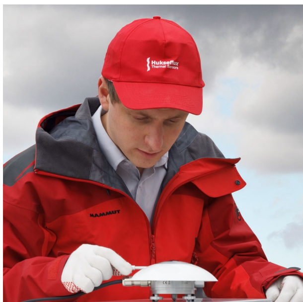
Figure 3 IR20 pyrgeometer being prepared for application