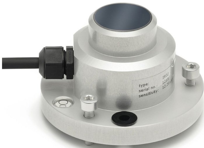
Figure 1 IR02 pyrgeometer with heater

IR02 is a pyrgeometer suitable for longwave irradiance measurements in meteorological applications. The instrument can be heated, which improves measurement accuracy as it prevents dew deposition on its window. Because of features like this, IR02 is popular and often used in agricultural networks.