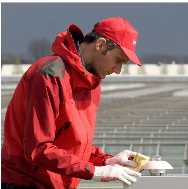
Figure 2 application example: solar sensor in use for greenhouse climate control; pyrgeometers are used for this application as well.