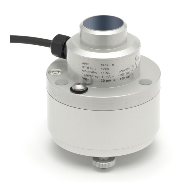
Figure 1 IR02-TR pyrgeometer with heater and 4-20 mA transmitter

IR02-TR is a pyrgeometer suitable for longwave irradiance measurement in meteorological applications. The instrument can be heated, which improves measurement accuracy as it prevents dew deposition on its window. IR02-TR houses a 4-20 mA transmitter for easy read-out by dataloggers commonly used in the industry.