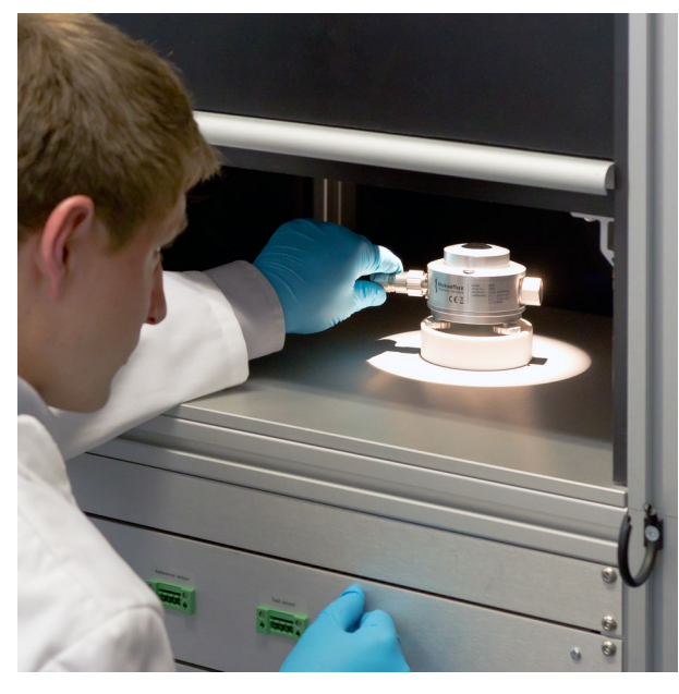
Figure 4 pyrgeometer during conformity assessment

Calibration of pyrgeometers used for downward longwave radiation is traceable to the World Infrared Standard Group (WISG). This calibration takes into account the spectral properties of downward longwave radiation. As an option, calibration can be made traceable to a blackbody and the International Temperature Scale of 1990 (ITS-90). This alternative calibration is appropriate for measurements of upward longwave radiation (with IRO2 pyrgeometers facing down).