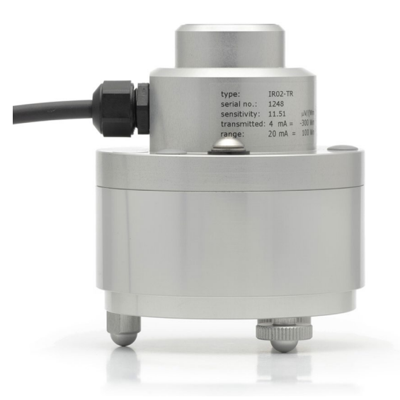
Figure 3 IR02-TR with heater and 4-20 mA transmitter