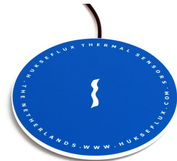
Figure 2 opposite side of HFP03, which has a blue coloured cover