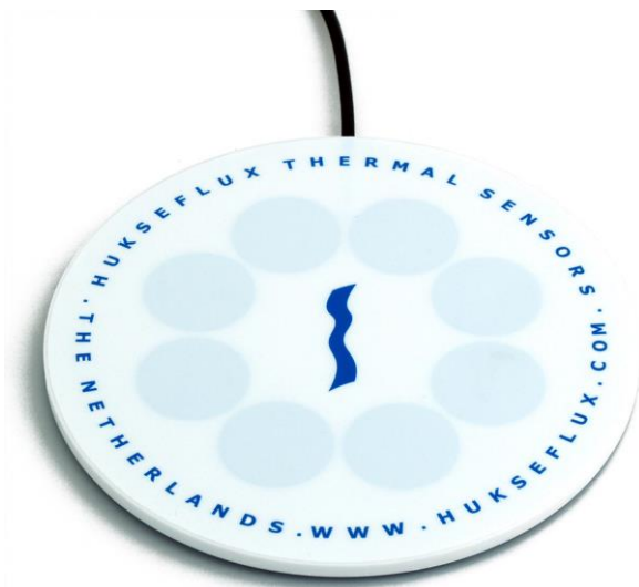
Figure 1 HFP03 ultra sensitive heat flux plate

HFP03 is an ultra sensitive sensor for measurement of small heat fluxes in the soil as well as through walls and building envelopes. The total thermal resistance is kept small by using a ceramics-plastic composite body. See also model HFP01 : putting several HFP01 sensors electrically in series is an alternative for using HFP03.