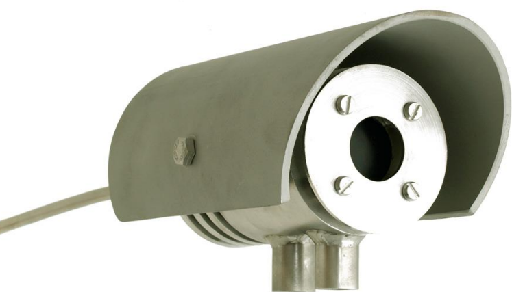
Figure 1 HF02 flare radiation monitor / heat flux sensor

HF02 is a sensor that measures radiant heat flux or thermal radiation in the outdoor environment. A common application is monitoring the radiation emitted by flares. HF02 is certified for use in potentially explosive atmospheres, and is rated for radiation levels up to 15 \times 10^3 \text{ W/m}^2 . We recommend use of HF02 in a decision-supporting role only, and not to use measurements of HF02 as the main or sole source of information for judging safety.