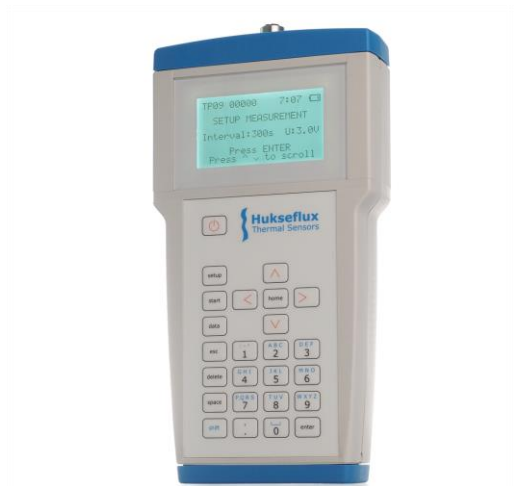
Figure 4 FTN02: CRU02 control and read out unit