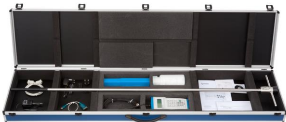
Figure 5 The complete FTN02 system: FTN02 includes one spare sensor TP09, adapters for charging the system in the office, WSA02, and in an automobile, CA02. Also included are communication software and a jar for glycerol. Glycerol must be purchased locally.