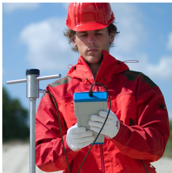
Figure 2 FTN02 being used in an on-site (field) survey

FTN02 is a thermal needle measuring system for on-site measurements of thermal conductivity (or the inverse value, resistivity) at depths from the surface down to a depth of 1.5 metre. Due to its robustness and length, FTN02 is the best solution for route-surveying of high-voltage electric power cables and heated pipelines (typical depth of burial of 1.5 m). The measurement method is based on the use of a "thermal needle". This method employs a heating wire and a temperature sensor in a needle. The FTN02 system consists of the thermal needle, model TP09, mounted on a long lance, LN02, and a control and readout unit CRU02. FTN02 is easy to use. After making a small-diameter access hole, the thermal needle TP09 is brought down to just above the point that must be investigated and then pushed into the local undisturbed soil below. The user performs control and readout of the measurement from the handheld CRU02.