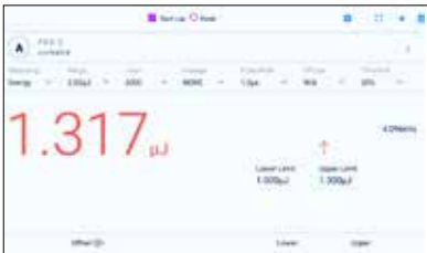
Pass/Fail screen. Excellent for QA purposes.