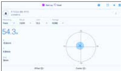
Power, Position, and Size measured with a BeamTrack sensor.