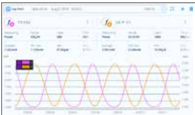
Two channels merging into one graph.