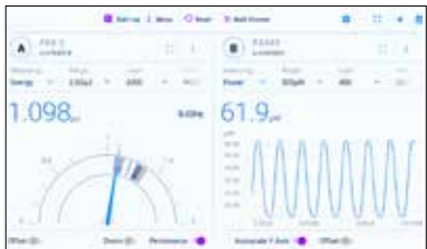
Two independent channels of measurement.