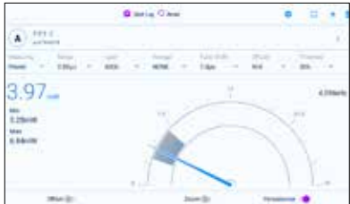
Analog needle display of power Persistence and min/max tracking.