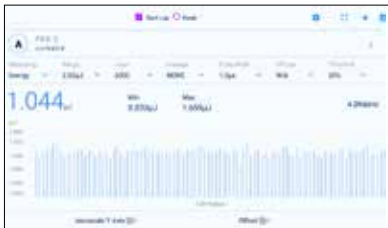
Pulse chart display of energy.