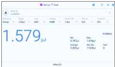
Display statistics of the present measurement session.