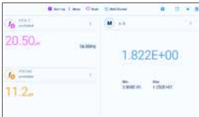
Two channels with a math comparison channel.