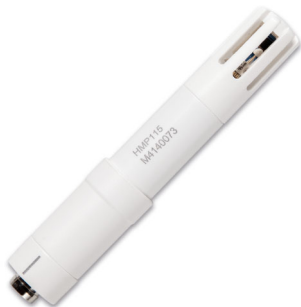
HMP63 and HMP115/T probes