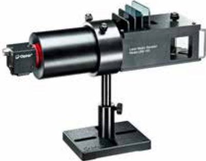
LBS-100 (SPZ17029) + LBS-100 combined with 4X beam reducer (SP90061+SPZ17017)