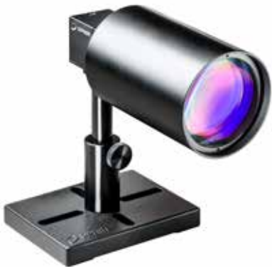
4X beam reducer

The 4X Beam Reducer is an imaging system that images the plane 30cm in front of the reducer onto the camera CCD sensor while reducing the size 4 times and inverting it. The beam reducer uses the 3 screw on attenuators provided with the camera. Since the intensity of a beam after reduction will be increased by 4 \times 4 = 16 times, it is advisable to attenuate the beam more than you would without beam reduction. This can be done with additional external beam splitters and attenuators which are available (see ordering information). Note that the custom designed beam reducer gives better image quality than tapered fibers since it does not introduce graininess or uneven pixel response. Also the image distortion of \sim 1\% is considerably lower than with most tapered fibers. The beam reducer is not compatible with CS mount cameras.