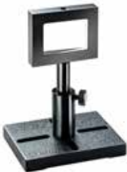
Optional large wedge beam splitter (SPZ17018)

Shown is an image of a laser with beam diameter of 13mm. As can be seen, it is easily seen with the SP920s, SP932U camera with the 4X beam reducer.