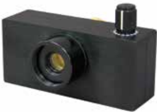
Figure 1 below shows the safe average power for negligible beam distortion from thermal lensing. Absorptive filters, such as used in the ATP-K have an upper power limit of approximately 100mW per mm beam diameter. For pulsed beams, Figure 2 shows the damage threshold for energy where breakage of the glass wedge may occur. This is approximately 5J per mm beam diameter. For lasers with power or energy levels above this the first stage of attenuation will need to come from our line of high power reflective attenuators.

The ATP-K is also designed to be used with the HP-series, high power attenuators and beam splitters. Both types of attenuators attach directly to the ATP-K via C-mount while a Beam profiler camera is attached form the opposite side. The ATP-K has simple reproducible attenuation settings, and has a wavelength range of 360 to 2500+ nm.