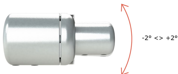
Figure 2 ALF01 albedometer levelling tool, can be rotated around the axis of the crossarm to which it is connected, and tilted over \pm 2^\circ .