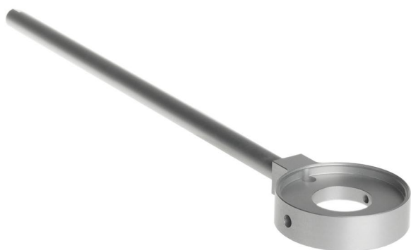
Figure 1 AMF02 or AMF03 albedometer kits are used to mount both an up- and a downfacing pyranometer, and construct an albedometer. The image shows the AMF02 mounting fixture and its rod. A glare screen for the downfacing sensor is also included.

Hukseflux offers a full range of dedicated, ready-to-use albedometers for measuring albedo. Alternatively, with the AMF03 or AMF02 mounting fixture in AMF / ALF series, you may choose to construct albedometers from popular Hukseflux pyranometers yourself. AMF03, AMF02 and SRA series albedometers can be levelled with ALF01 levelling fixture.