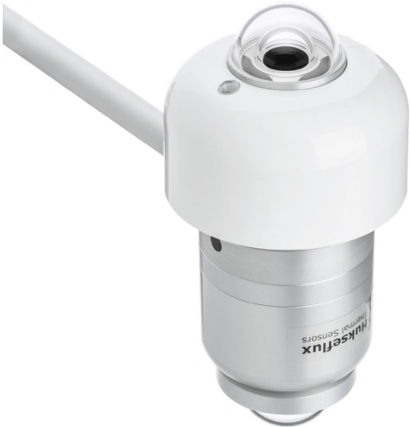
Figure 5 the end result using AMF03 and two SR30-M2-D1 pyranometers: SRA30-M2-D1 albedometer