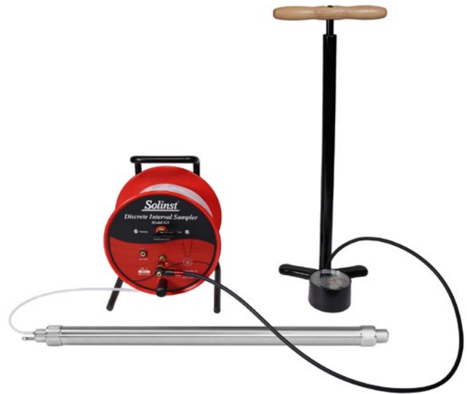
1.66"ø Discrete Interval Sampler with High Pressure Hand Pump

Biodegradable disposable PVC bailers and stainless steel Point Source Bailers are also available from Solinst (see Model 428 BioBailer & 429 Point Source Bailer Data Sheets).