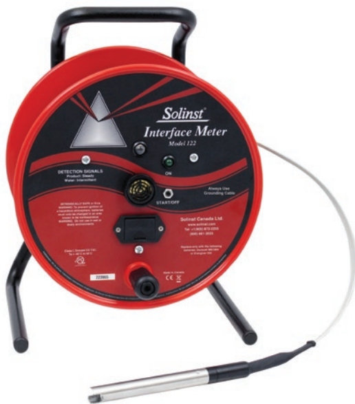
Oil/Water Interface Meter