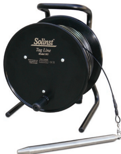
Tag Line / Suspension Cable