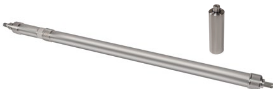
425-D Deep Sampling Discrete Interval Sampler and Weight