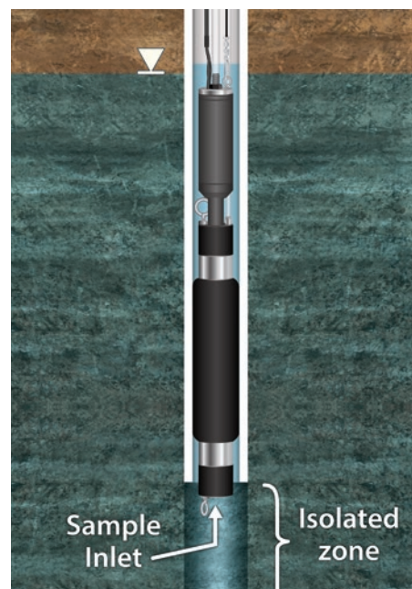
A Model 800M Packer can be used to isolate the sampling zone and reduce purge volumes.

Tag Line: Convenient reel-mounted marked cable, for measured depth deployments. (See Solinst Model 103 Data Sheet).