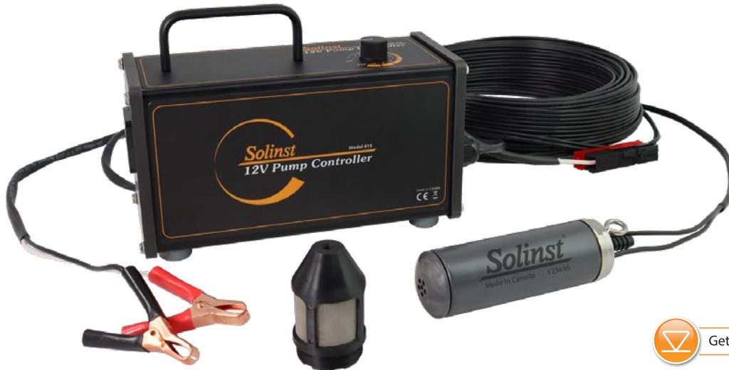
(Optional Water Filter)