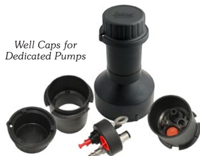
Well Caps for Dedicated Pumps

The DVP is suitable for low flow or regular flow sampling. The stainless steel pumps can operate to depths of 150 m (500 ft).