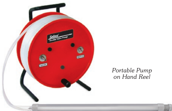
Portable Pump on Hand Reel

For less frequent sampling, reel mounted portable systems allow access to multiple monitoring wells, even in remote locations. The reel mounted portable units are free-standing with a convenient carrying handle. They can be made for almost any size or depth of application.