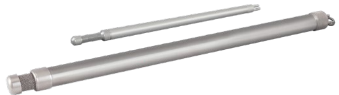
1.66" (42 mm) and 5/8" (16 mm) Diameter Stainless Steel Double Valve Pumps