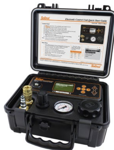
Model 464 Electronic Control Unit (125 psi and 250 psi Models)

The pump is quick to disassemble and the bladders and screens are simple to replace in the field. No tools required. Inexpensive polyethylene bladders can be quickly replaced to suit regulatory requirements.