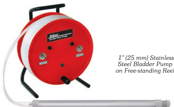
1" (25 mm) Stainless Steel Bladder Pump on Free-standing Reel

They are supplied on a free-standing reel. The rugged systems are very convenient and easy to transport. Tubing fittings on the reels and controller are compression fittings, allowing quick set up in the field. The Solinst Model 103 Tag Line can be used to lower and support the pump in the well (see Model 103 Data Sheet).