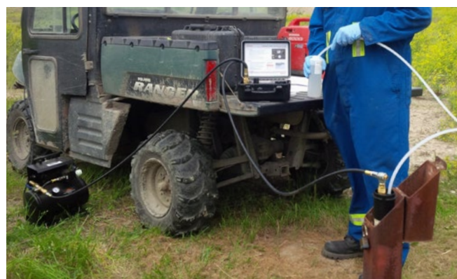
Sampling with a Dedicated Bladder Pump using Portable, Rugged, Easy-to-use, Compressor and Controller

For water level monitoring there is an access hole to fit a Solinst Model 101 Water Level Meter or Levellogger. An eyebolt is provided for a pump support cable or for suspension of a Solinst Levellogger, (see Model 3001 Data Sheet) or other device.