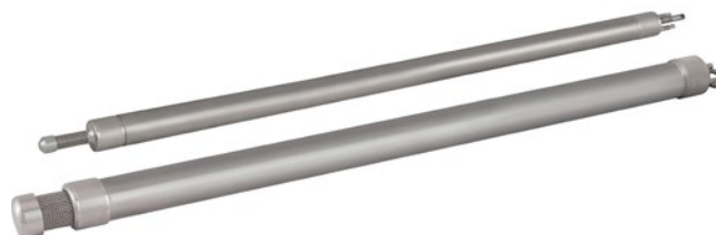
Solinst Bladder Pumps available in Stainless Steel 1" and 1.66" (25 mm and 42 mm).