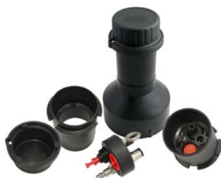
Well Caps for Dedicated Pumps

The caps slip easily onto 2" dia. (50 mm) wells. Adaptors to fit 4" dia. (100 mm) wells are also available. They have quick-connect fittings for the drive and sample tubing.