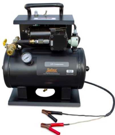
12 Volt Compressor

The compressor operates using 12 volt DC power source, such as a car or truck vehicle battery, and comes with alligator clips. The compressor operates at up to 150 psi and is equipped with a 2 US gallon (7.6 L) air tank which is rated to 175 psi.