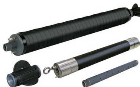
Model 800 Packers 3.9" and 1.8" (99 mm and 46 mm)

Model 800 Low-Pressure Packers can be used with Solinst Bladder Pumps to minimize purge times by reducing purge volumes. This reduces the cost of water disposal and labour. Packers are available in single point or straddle packer designs, and in sizes to fit 2" (50 mm) to 5" (127 mm) dia. wells. (See Model 800 Data Sheet.)