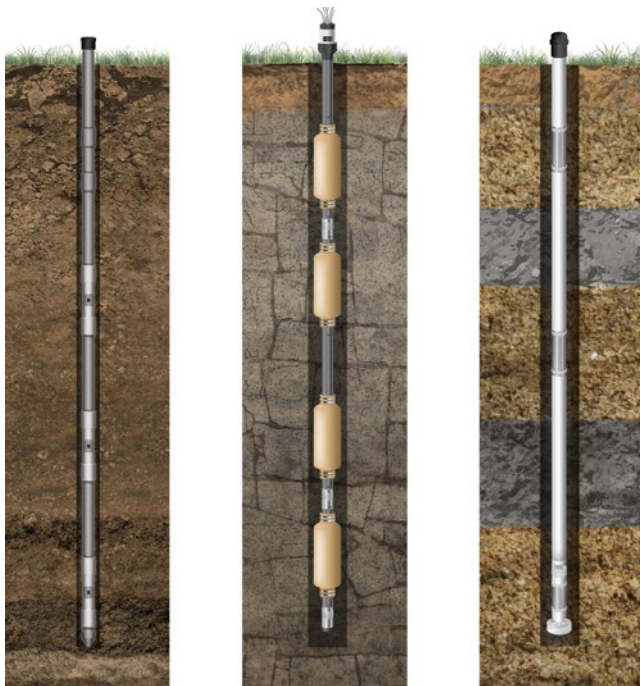
615ML Multilevel Drive-Point Piezometer

Saves Cost – through reduced permitting and drilling costs; and because narrow tubes allow smaller purge volumes, reduced disposal costs, efficient low flow sampling and rapid response to pressure changes, all reduce field time.