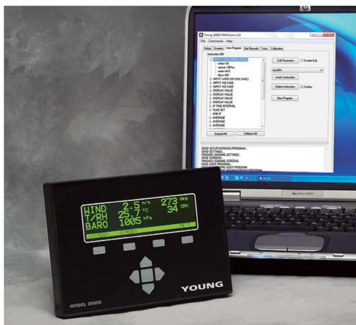
The 26800 is fully programmable and includes RMYComm software for setup and data transfer.

2,162,688 Single-precision floating point values for data records 256 Temporary floating point values for user program 1 to 512 user program instructions