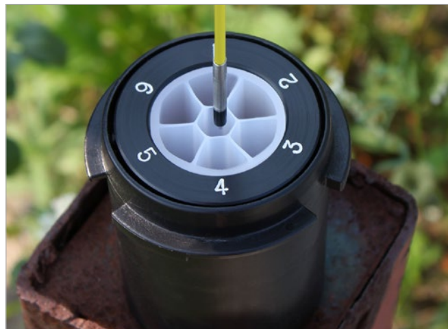
Measure water levels within the narrow channels of a Solinst CMT® System.

The 102M Mini Water Level Meter is available in 25 m and 80 ft lengths. There is the choice of the P4 or P10 Probe.