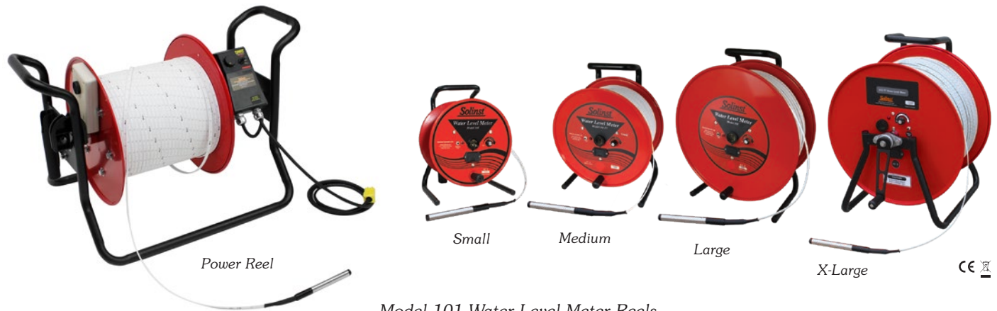
Model 101 Water Level Meter Reels